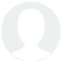
John Stultz, III